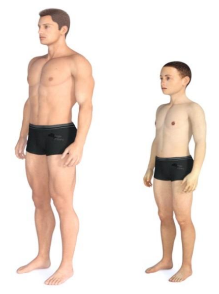
Figure 3. Average levels of muscularity selected as 'most attractive' in an adult man (L), and 'ideal for me' (R) in a sample of 35 6-9 year old boys in North East England, using an interactive computer task.

have grown increasingly muscular [11] and increasingly prominent. Male images in magazines aimed at men (e.g. Men's Health) are consistently more muscular than those in magazines aimed at women [12]. For instance, while women in our Nicaraguan sample are more likely to be dieting if they watch more TV, we have been finding that young men are increasingly interested in body building. In the UK, we have begun researching body image in boys using interactive figure scales which are based on isolating muscularity and adiposity. As shown in Figure 3, 6-9 year old boys select as their 'ideal' a highly muscular male and a moderately, but still unusually, muscular boy. Although there are specific scales targeting desire for muscularity [13] these have not been widely deployed in large scale body image research and are unsuitable for use with children. As such our understanding of body dissatisfaction in boys